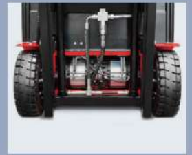
Front dual separated motors