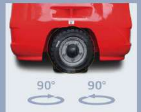
The small turning radius is suitable for narrow channel