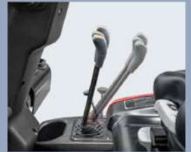
Cover can be easily opened by adjusting the levels forward