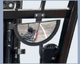
Panoramic rearview mirror