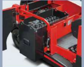
Battery side roll out is taken as the standard configuration in order to easily and fast replace the battery