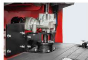
Electronic power steering system (for stand-up driving type tractor)