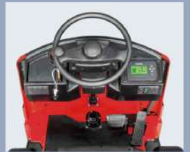
Modern outline design with LCD instrument and USB charging port