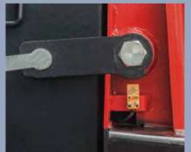
The locking device of the battery is provided with the safety protection function. Only if the locking device is rotated in place, the tractor can travel