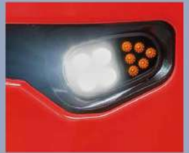
Reliable LED lighting