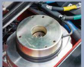
Electrical Park Brake (EPB) system