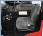
Comfortable and convenient seat