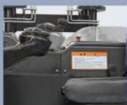
The steering wheel is extensible, so the operator can choose the best driving position.