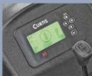
Instrument can display the steering angle and direction synchronicity