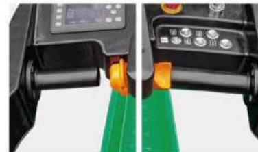
Right and left hand sensing