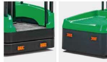
Front and rear flashing lights